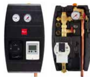
CSE SOL single-line