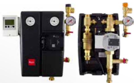
CSE2 SOL twin-line