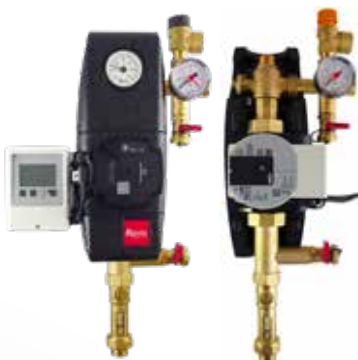
CSE1 SOL single-line